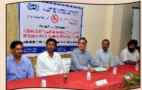
A View of Dais