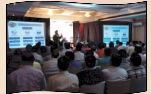
Workshop in progress