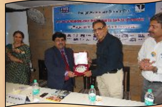
Design Awareness Seminar on Clean Air/Woodenware Instruments Industry Cluster held on 7th August 2013 at Ambala Cantt