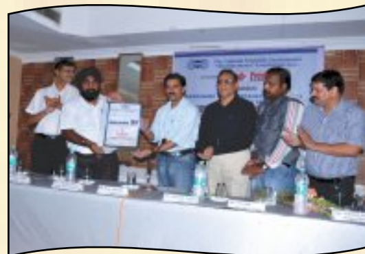
The launching of Global Lab Expo-2014 by Chief Guest.