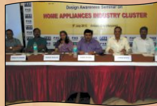
Design Awareness Seminar on Home Appliances Industry Cluster held on 9th July 2013 at Ambala City