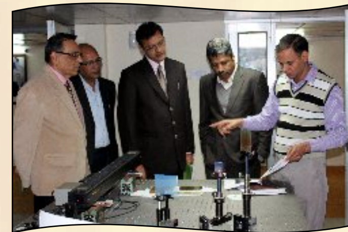
A CSIO Scientist explains the working of an optical instrument.