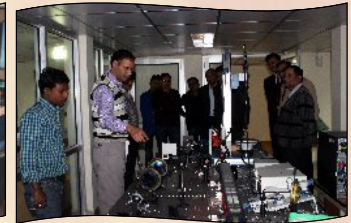
Members having a view of optical section.