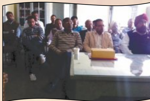
ASIMA members attending seminar at DAV College, Ambala City

This activity was extended to Departments of Chemistry, Botany, Zoology & Bio-Technology for some selected experiments on Abbe Refractometer, pH Meter, Water Distillation Plant, Calorimeter, Microtome, Autoclave, Laminar Air Flow & Centrifuge etc. Sugestions for improvement & modifications of these instruments were given by Professors of the concerned Departments.