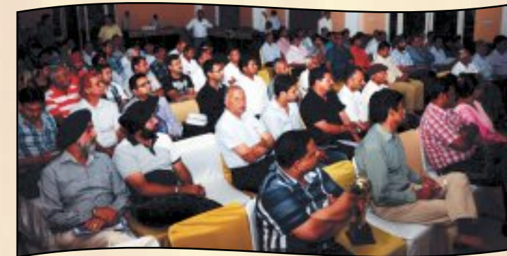
A view of audience