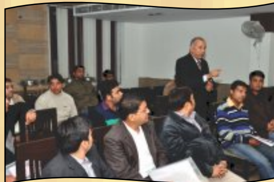
Design Awareness Seminar on Ophthalmic Cluster held on 12th December 2013 at Ambala Cantt.