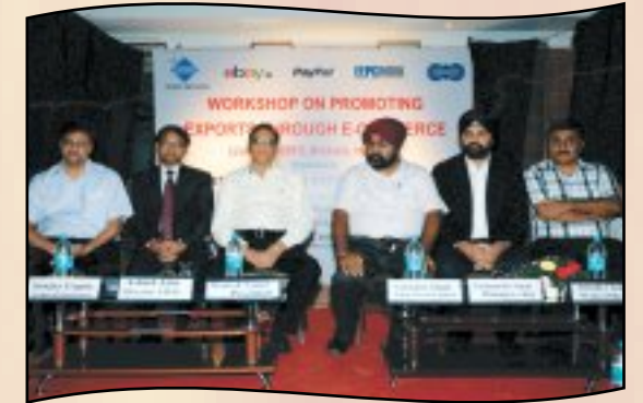
A view of dais

The first General Body meeting of this tenure was held on 21-6-2013 when a workshop on “Promoting Export through E-commerce” was conducted at Food Court, Ambala Cantt for ASIMA members. It was sponsored by ebay and FIEO (Federation of Indian Export Organizations). ebay officials through power point presentation apprised the members about marketing their products online through computers. ebay is a marketing company providing a big platform to online sellers and buyers.