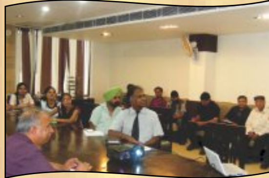
Design Awareness Workshop for Electronic Instruments for Labs-Cluster held on 3rd - 7th July 2013